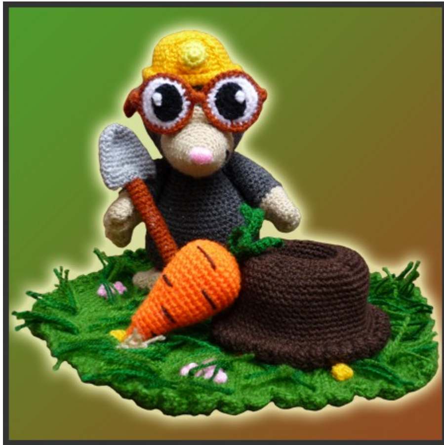
Eugene, The Mole