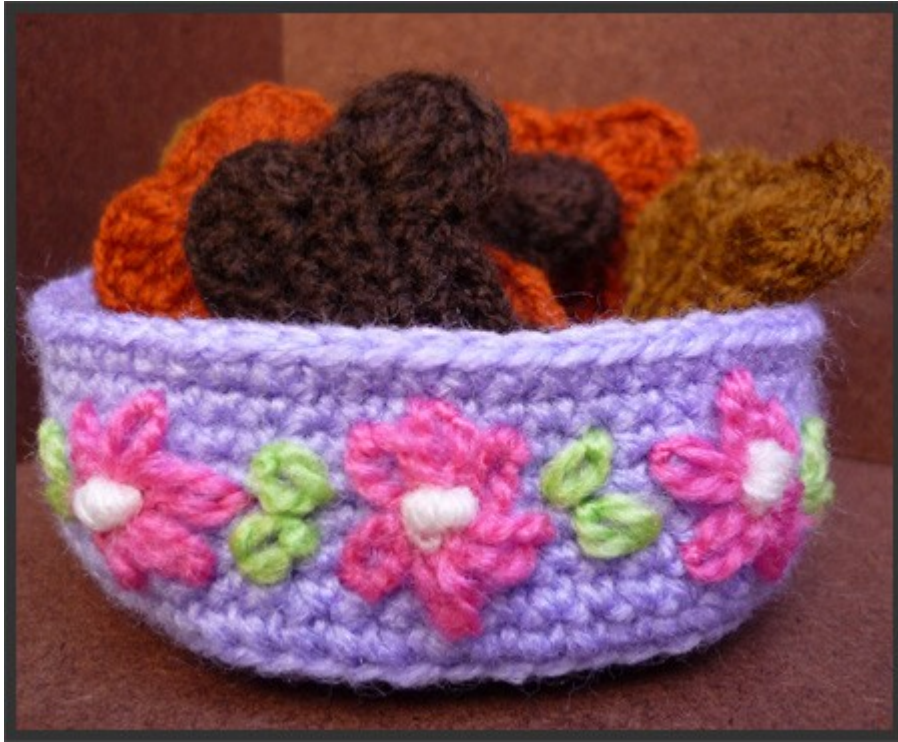
Plate (lilac color):